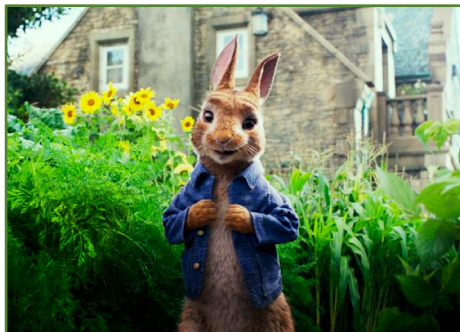
Peter Rabbit (2018)

A major feature film, Peter Rabbit 2 , is to be filmed in Richmond from Sunday 31st March to Sunday 7th April. Specific scenes are scheduled at the junction of Duke Street and Quadrant Road on Tuesday 2nd April, and in King Street and Old Palace Terrace on Thursday 4th April. FoRG is receiving a significant donation that will be put towards the Fountain project on The Green.